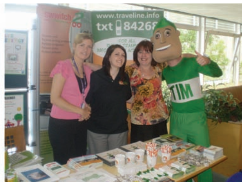
NHS Environment week 2009

Frontline call centre staff were identified as a staff group that regularly receives and answers questions and queries, and provide travel information directly to patients accessing hospital sites. It was decided that these staff members would benefit from increasing their knowledge of travel choices through Smart Travel training.